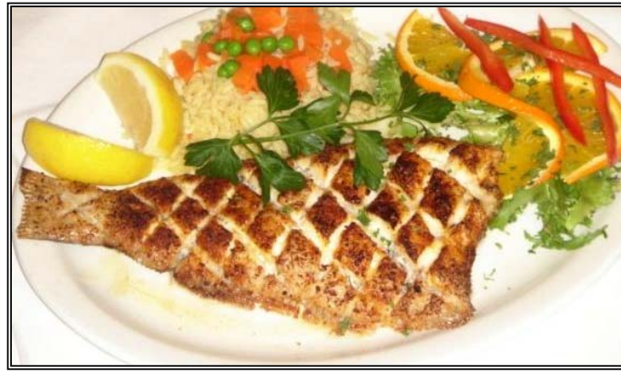
BROILED TWIN LOBSTER TAILS 34.95 Stuffed with Crabmeat 36.95 6 oz. Tails with Drawn Butter, Served with Potato, Vegetable and Soup or Salad