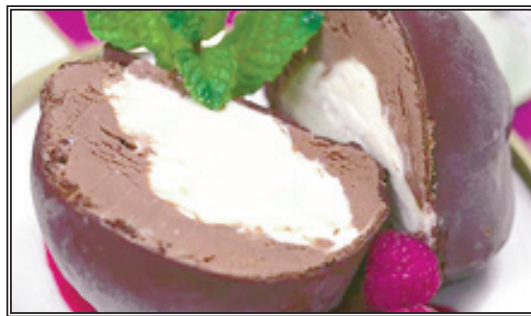
TARTUFO 7.95 Vanilla & Chocolate Ice Cream in a Chocolate Shell